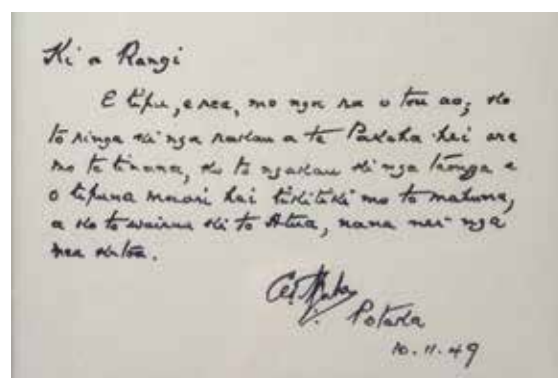
Photo of the original 'E tipu, e rea' in Sir Apirana Ngata's handwriting, as displayed at Ngata Memorial College. The text is quoted on page 3.