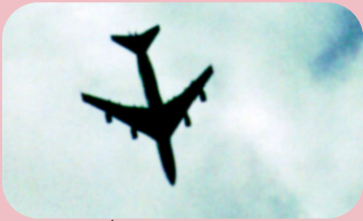
He waka rererangi